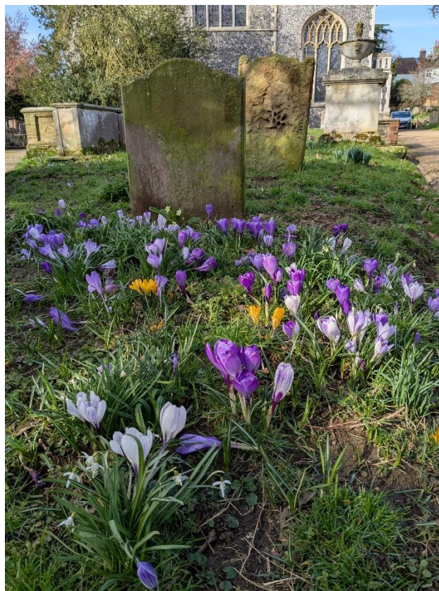
Crocus at St Mary’s Woodbridge, March 2025

LOOKING TO BE CONFIRMED? There is a wonderful opportunity to be Confirmed in our Cathedral during Eastertide, on Sunday 4 th May at 10.30am . Please have a word with Fr Nigel if you are tempted!