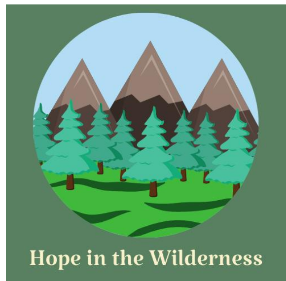
Theme of this week's sermon

08.00 BCP Eucharist, Woodbridge 10.00 Parish Eucharist, Woodbridge 15.00 Nota Bene Chamber Choir concert, St Mary's, Woodbridge (in aid of our Building Project Appeal)